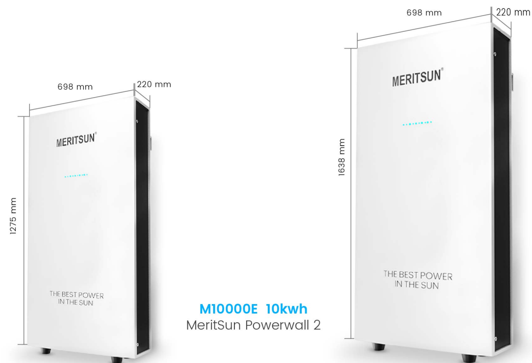
M5000E/M5000U 5kwh MeritSun Powerwall 2